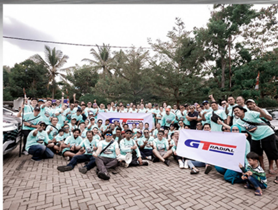
HYSTORI CELEBRATES ITS 3RD ANNIVERSARY WITH STRONG COMMUNITY ENERGY