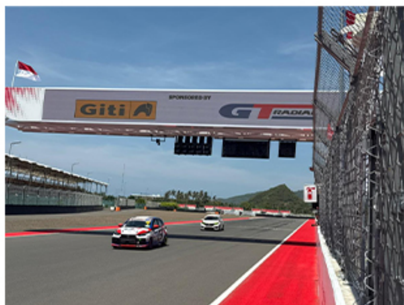
GT RADIAL AT THE MANDALIKA FESTIVAL OF SPEED 2025 SUPPORTING INTENSE BATTLE OF THE SUBARU BRZ SUPER SERIES AHEAD OF THE FINAL