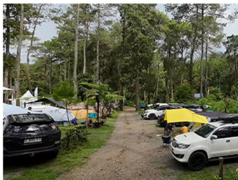
GT RADIAL SUPPORTS THE 7TH ANNIVERSARY OF INDONESIA FORTUNER CHAPTER TANGERANG RAYA IN LEMBANG