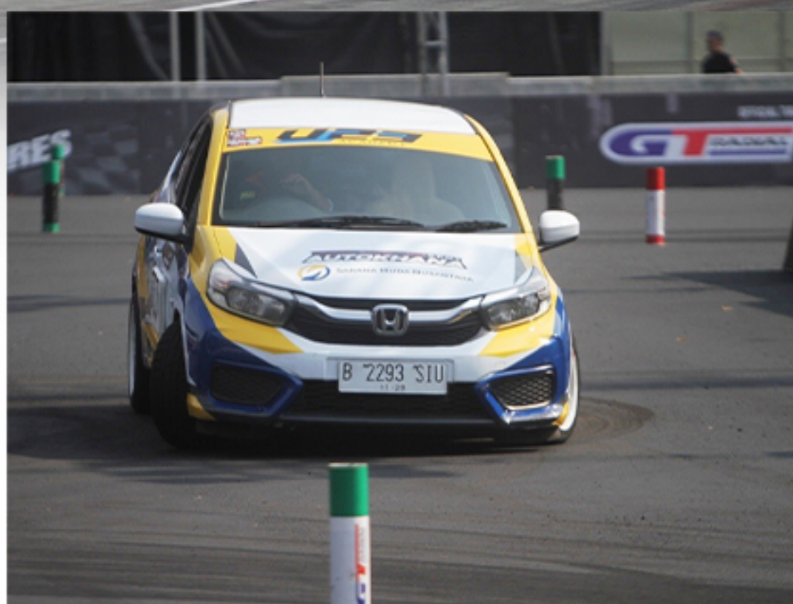
GT RADIAL SUPPORTS TGRI'S PRECISION PERFORMANCE AT AUTHOKHANA SLALOM 2025 ROUND 4 IN PURWOKERTO