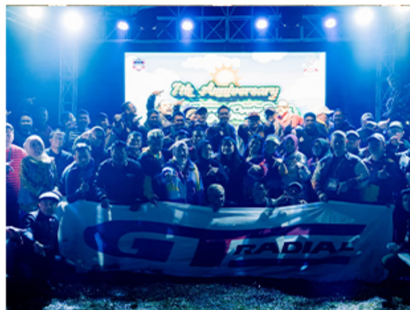
GT RADIAL SUPPORTS THE 5TH NATIONAL JAMBOREE OF TERIOS CLUB INDONESIA IN LAMPUNG